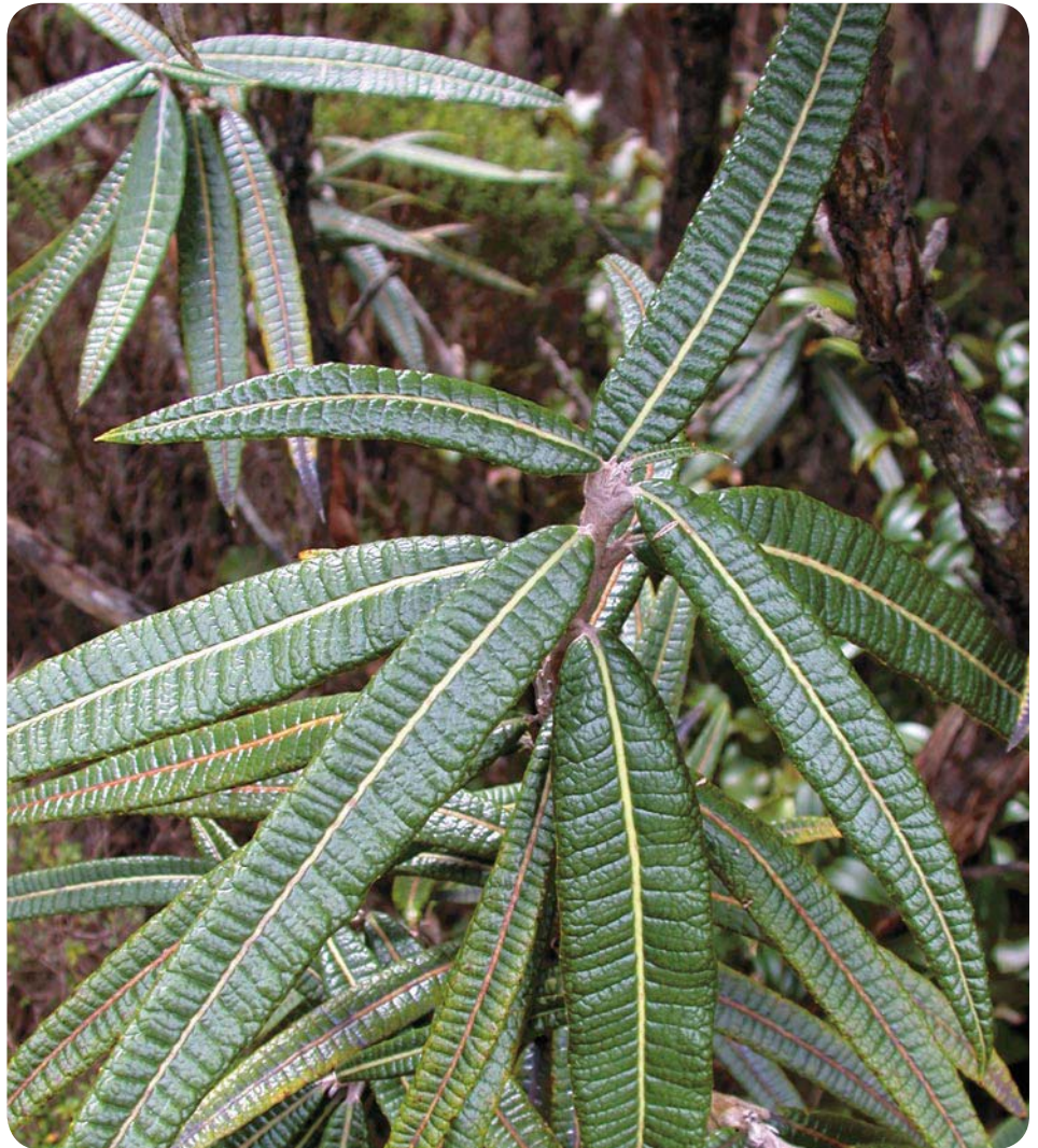
Olearia lacunosa (Asteraceae)