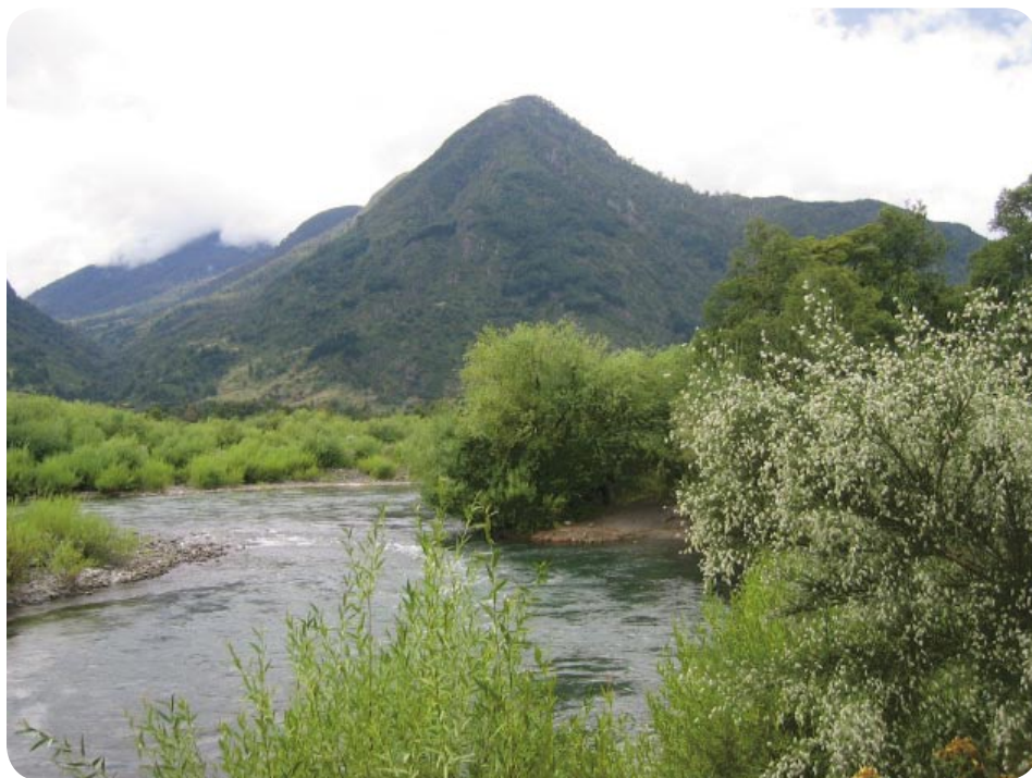
Streamside habitat in Chile

To hear more of my adventures I will be giving a presentation of this collecting trip at an evening potluck scheduled for Thursday, July 24, 2008. I hope you can make it. I will show images from several botanical gardens and many outstanding plants.