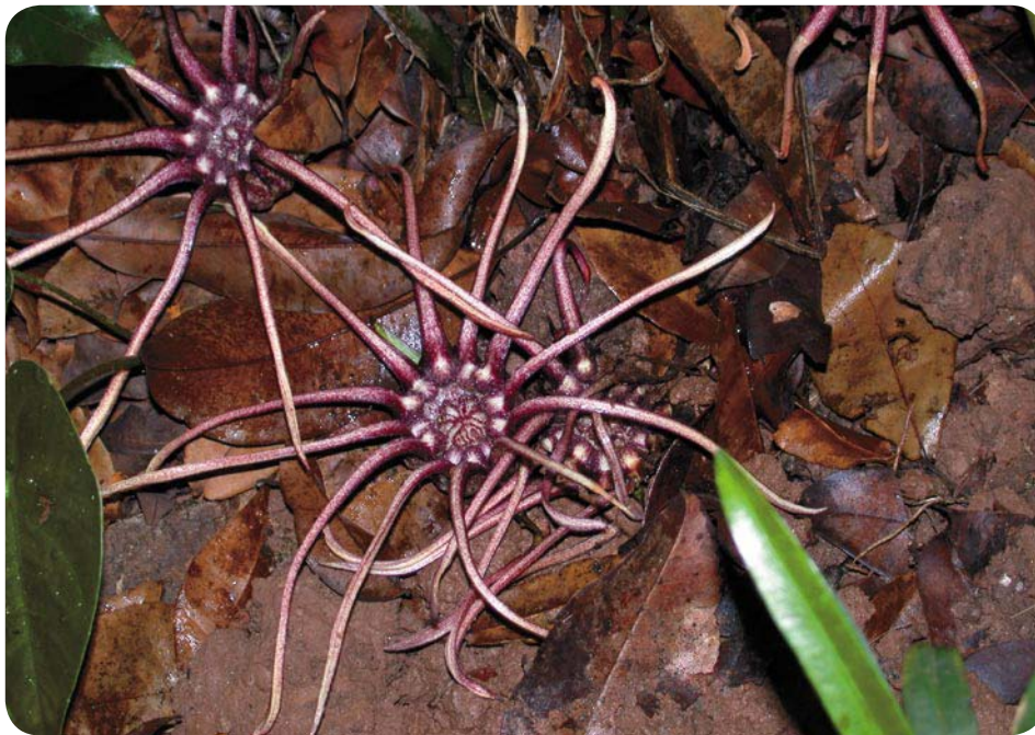
Living type in cultivation of an unnamed species of Aspidistra from Viet Nam.