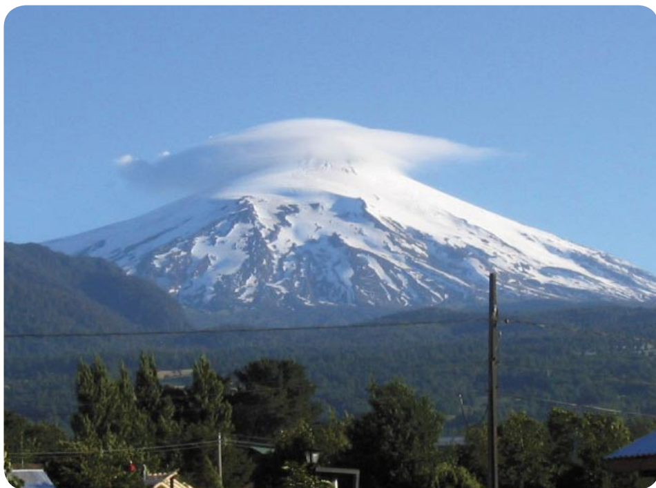
Active Volcano Villarrica (9,430 ft)

In southern Chile, the vegetation changes as the amount of rainfall increases. In these higher rainfall areas, the vegetation is dominated by the large southern hemisphere beech, Nothofagus spp (Fagaceae). In this region is a specific forest type known as the Valdivian rain forest. Here the coastal mountain range is right near the ocean, and the abundant rainfall is measured in meters. Several species of Nothofagus dominate these wet forests, Nothofagus dombeyi , N. oblique , N. antarctica , N. alpina . These trees are evergreen although partial leaf color change and drop does occur in the fall. In general they are fast growing trees, N. dombeyi , the tallest, reaches a height of 150 feet. As one might expect, in a temperate rain forest, there is high diversity of species. In these forests are the bell flower, Lapageria rosea (Philesiaceae (Smilacaceae)), the national flower a vine climbing into the trees and forming large 3-4" long and hanging, bell-shaped flowers. These blooms grace the forest with ornament. In this region are three members of the protea family (Proteaceae), Embothrium coccineum , a small tree with its beautiful red flowers, Lomatia hirsuta , also a small tree of great