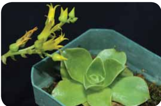
Dudleya stolonifera , the Laguna Beach live forever, is listed as a California Rare species and is known from only six localities.