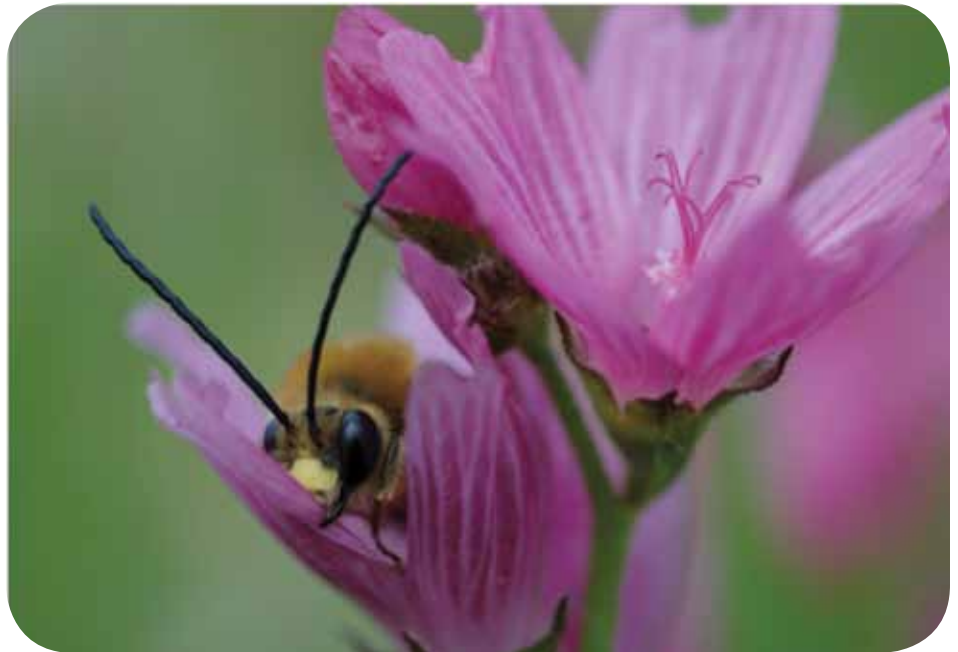
Eucera sp. on Sidalcea malviflora, Bonny Doon, Ca.