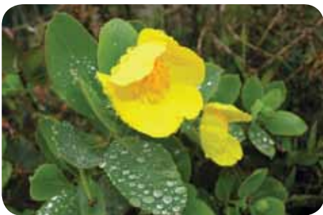
Dendromecon hardfordii — Santa Cruz Island.

Dendromecon hardfordii or Island Bush Poppy is native to Santa Cruz and Santa Rosa Islands in California. It is an evergreen shrub with large bright showy yellow saucer shaped flowers. Its not an easily plant to propagate and is not readily available in nurseries. We were fortunate to have been able to grow these plants from seed.