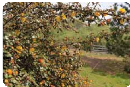
Fremontodendron californicum 'Butano Ridge'