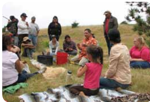
Work & Learn Gathering. Photo by Rick Fores, UCSC Arboretum "outback" Native Area, Spring 2012